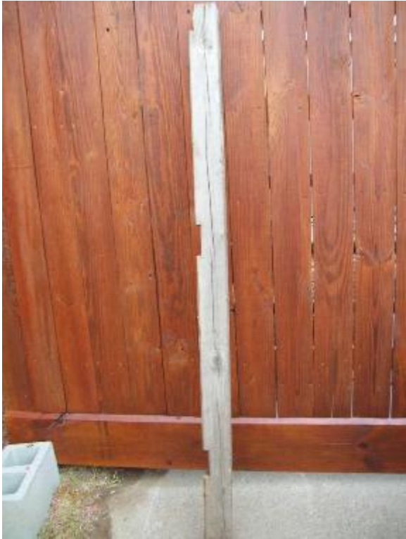
3 Fence post 7/20/2009 Hand cut notches for 2x4 stringers

1310 Iowa Street South Houston, Texas Serving the Houston/Pasadena area for over 40 years Texas State Builder Registration # 45583